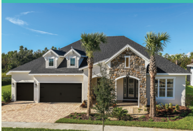
SAVANNAH BY CARDEL HOMES

1 - 2 Story • 2,805 - 3,952 sq. ft. 4081 Epic Cove