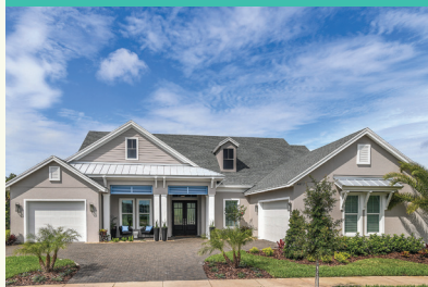
AVALON BY ARTHUR RUTENBERG HOMES

1 - 2 Story • 3,400 - 4,688 sq. ft. 4057 Epic Cove