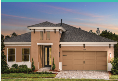
SANDPIPER BY HOMES BY WESTBAY

1 - 2 Story • 2,100 - 3,380 sq. ft. 4620 Ballantrae Boulevard