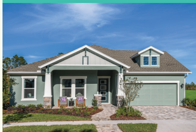
TANGELO BY DAVID WEEKLEY HOMES

1 - 2 Story • 2,685 - 3,827 sq. ft. 4082 Epic Cove