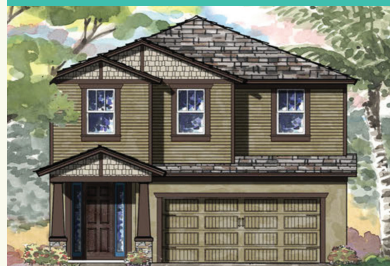
CYPRESS BY HOMES BY WESTBAY

2 Story • 2,427 - 2,761 sq. ft. 4668 Ballantrae Boulevard