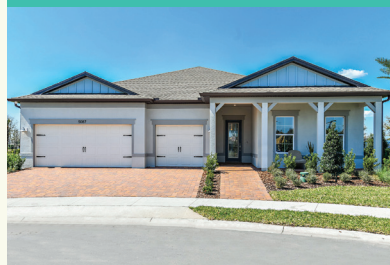
RENOWN BY DEL WEBB*

1 - 2 Story • 1,405 - 3,361 sq. ft. 5087 Caravel Point