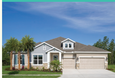
HOLLOWELL BY DAVID WEEKLEY HOMES

1 - 2 Story • 2,901 - 3,769 sq. ft. 3808 Tour Trace