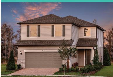
DRIFTWOOD BY PULTE HOMES

1 - 2 Story • 1,822 - 2,615 sq. ft. 4644 Ballantrae Boulevard