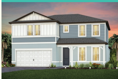
WHITESTONE BY PULTE HOMES

1 - 2 Story • 1,850 - 3,416 sq. ft. 4604 Ballantrae Boulevard